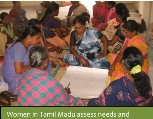
priorities of local communities

Hyogo Framework for Action 2005 – 2015: Building the Resilience of Nations and Communities to Disasters